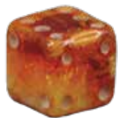
US Die, 1977.01.0158K.

We play games to learn, develop skills and strength, for enjoyment, and even just to pass the time. Every society enjoys gaming of some kind, and it is interesting to note that nearly identical games have sometimes been invented in different regions across the globe. With our temporary exhibit, Past Time Pastimes: Vintage Board Games currently on display through July 8, 2018, we decided to delve into our records to find the different types of games, game pieces, toys, and game related items in our collections.