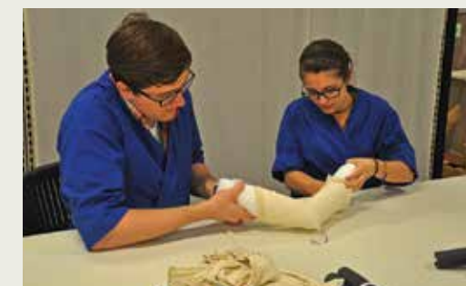
Collections students creating padded hangers to store clothing artifacts safely.