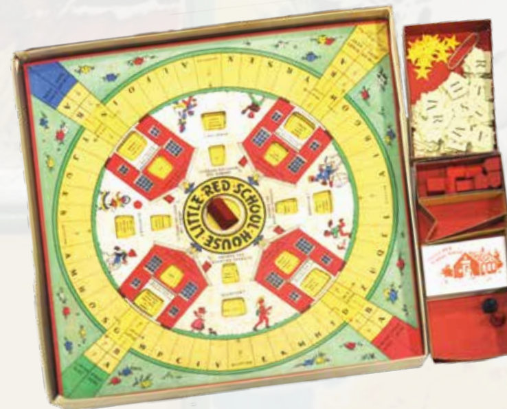
Little Red School House game.