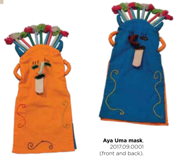
Aya Uma mask. 2017.09.0001 (front and back).