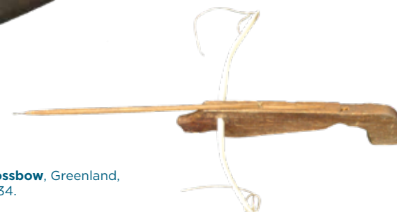
Child's crossbow, Greenland, 1998.19.3234.