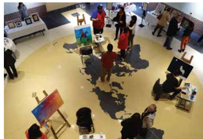
The Native Pop event at the Museum.

Large events like the Preservation Emporium bring together staff from many campus units to help teach visitors about taking care of material culture. Held every other year, this event gives visitors a chance to speak with members of the University's Preservation Working Group and other campus preservation experts to discuss items they want to ensure survive for future generations, such as print and paper material, historical artifacts, and analog and digital media. The Preservation Working Group is a campus committee dedicated to protecting and providing access to cultural assets. Its members come from across colleges and units: Spurlock Museum, Krannert Center