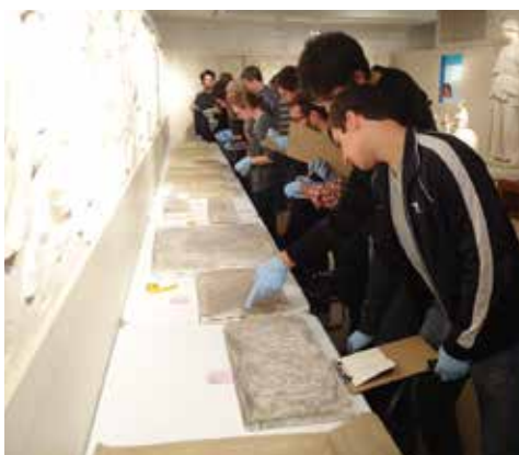
Studying artifacts in the Ancient Mediterranean Gallery.

This spring, we taught two courses in University Laboratory High School's Agora Days program. For four days each winter, Uni switches gears from its regular curriculum to enable students to take courses on a huge range of