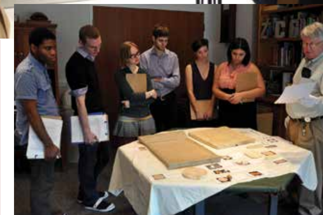
Up close with artifacts.

In future issues of this publication, we'll talk about collaborations beyond campus: schools, scouts, and other community groups. Are you part of a learning community or cultural organization that would like to try out a project with us? Drop us a line at spurlock-museum@illinois.edu to begin the conversation.