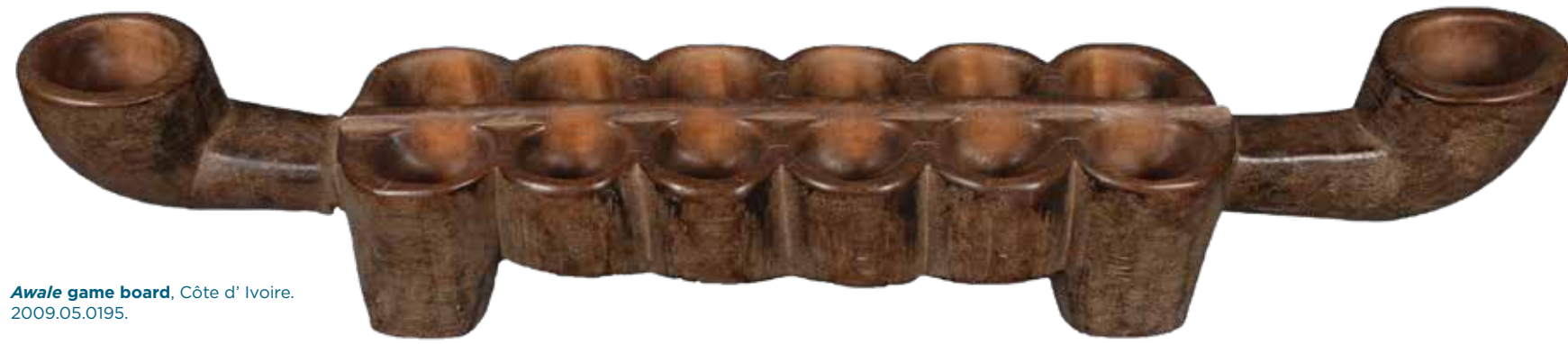
Awale game board , Côte d' Ivoire. 2009.05.0195.