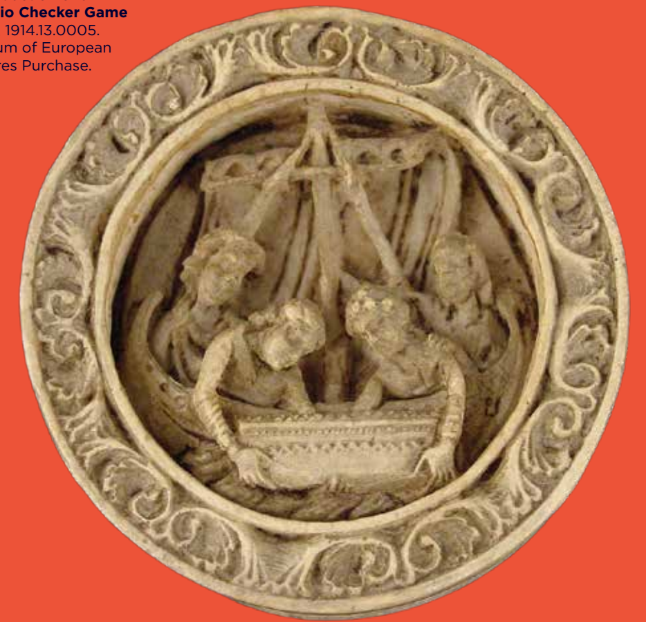
Reproduction of an Intaglio Checker Game Piece , 1914.13.0005. Museum of European Cultures Purchase.

Eli Lilly and Company Foundation Fidelity Charitable Gift Fund Prudential Foundation Inc Robeson Family Benefit Fund T. Rowe Price Program for Charitable Giving