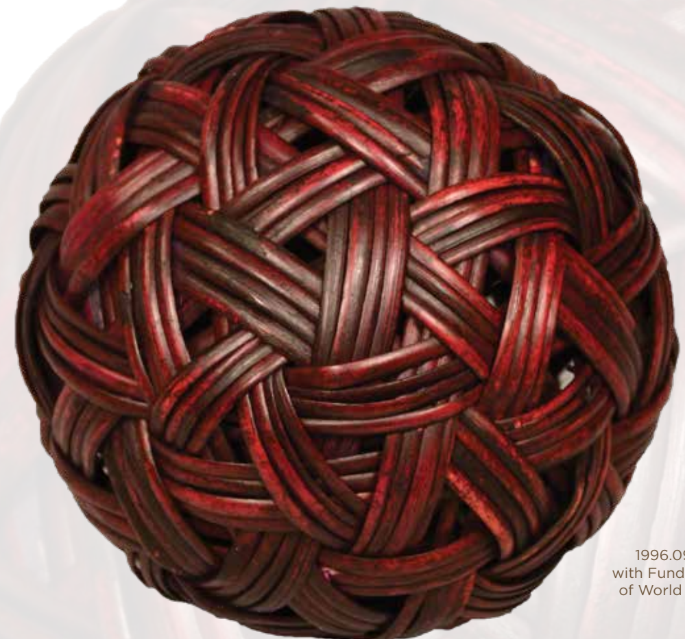
Basketry Ball , 1996.09.0007. Purchased with Funds from the Friends of World Heritage Museum.