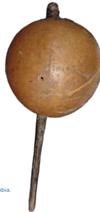
Toy twirler, Colombia. 2000.01.0326.