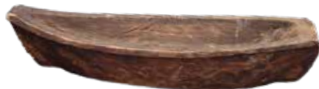
Toy canoe, Colombia and Ecuador. 2000.01.0704.

There are a number of toy canoes in the collection that com from Colombia and Ecuador. These boats could be easily carved from a relatively small piece of wood and raced in small ponds or streams of water. Toy vehicles are always popular with children, and these small watercraft suggest that canoes were important and possibly commonplace in the community in which they were created.