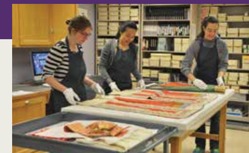
Registration students documenting artifacts.