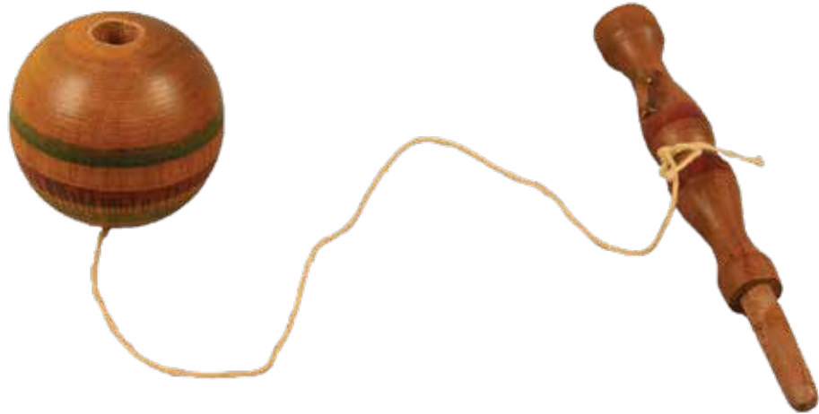
Wooden ball and stick game, 2015.08.0123.