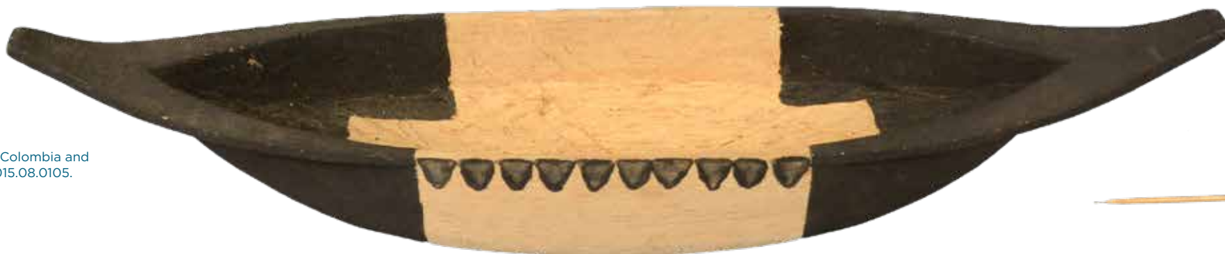
Toy canoe, Colombia and Ecuador. 2015.08.0105.