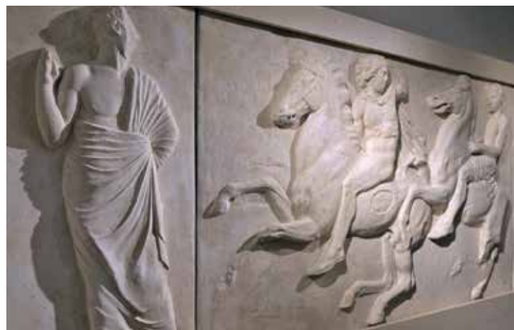
White plaster casts of the once colorful Parthenon Frieze.

subjects taught by community members, University faculty, and even their peers. One course, titled "Those Statues Weren't White," focused on the history of display of Greek and Roman marble statuary with the perspective of their origins as brightly colored objects. After a quick field trip to see the Spurlock's plaster casts of these statues, which are also white, we considered how this knowledge affects the ways we imagine the lives and material surroundings of the ancient Greeks and Romans. Students finished the week by digitally painting some of the Spurlock's casts, quickly demonstrating the original multicolored works.