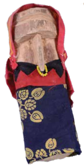
Doll, San Blas Islands, Panama, late 20th c. 2017.14.0008.