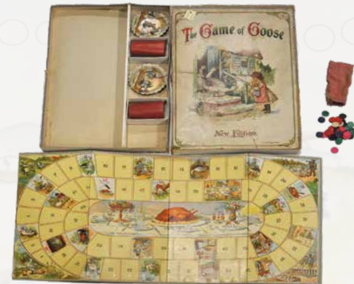
The Game of Goose.

Roll the dice and spin the spinners: it's time to play a game! On April 5, the Museum opened an exhibit created in partnership with Playful by Design, the Interdisciplinary Game Studies at Illinois Spring Symposium held on campus.