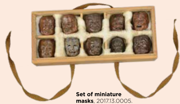
Set of miniature masks. 2017.13.0005.