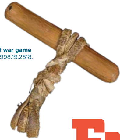
Tug of war game grip, 1998.19.2818.