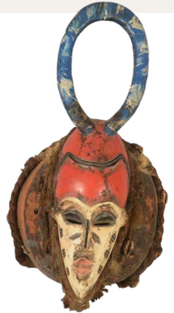
Mask, Gabon, 2017.14.0018. The Warfield Collection.