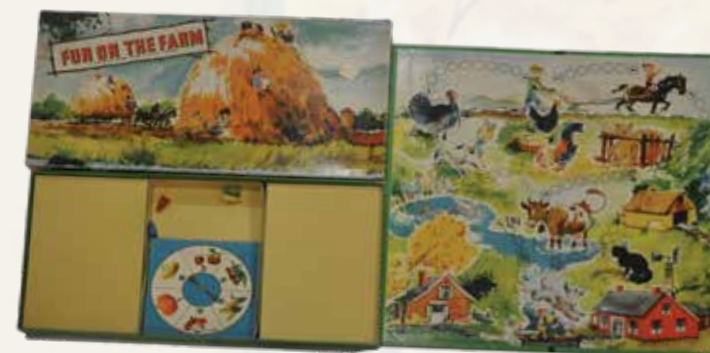
Fun on the Farm game.