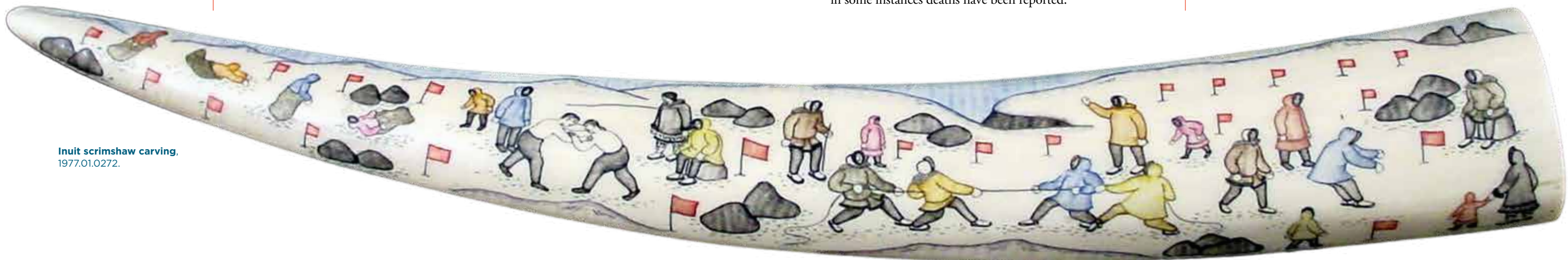
Inuit scrimshaw carving, 1977.01.0272.

Finally, this grip (on top left page), from a tug of war game was collected during the Crocker Land Expedition to the North Polar Region sometime between 1913-1917. This joint research venture to Greenland was conducted by the American Museum of Natural History and the American Geographical Society with the cooperation of the University of Illinois.