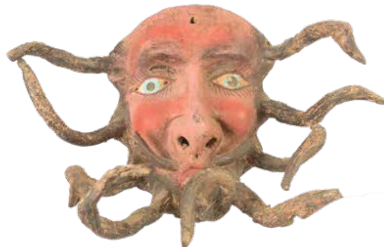
Barbon Mask, Mexico. 2017.14.0013.