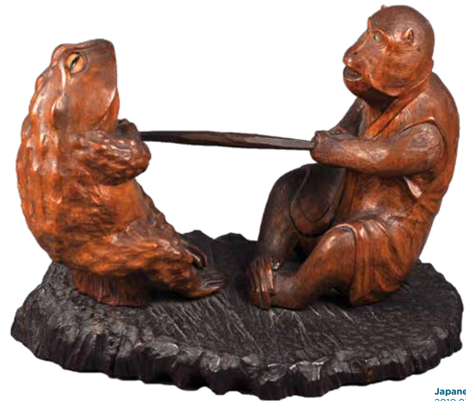
Japanese boxwood okimono, 2010.03.0001.