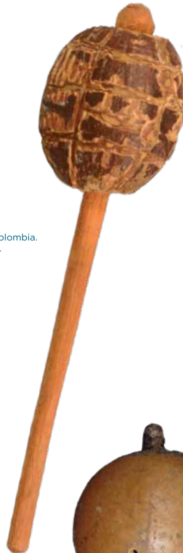
Toy twirler, Colombia. 2000.01.0336.