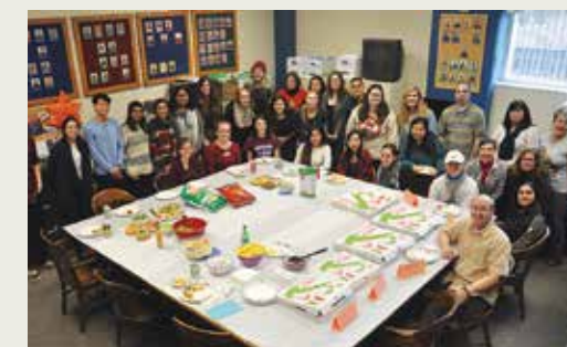
Our student lunch at the end of the fall 2017 semester.