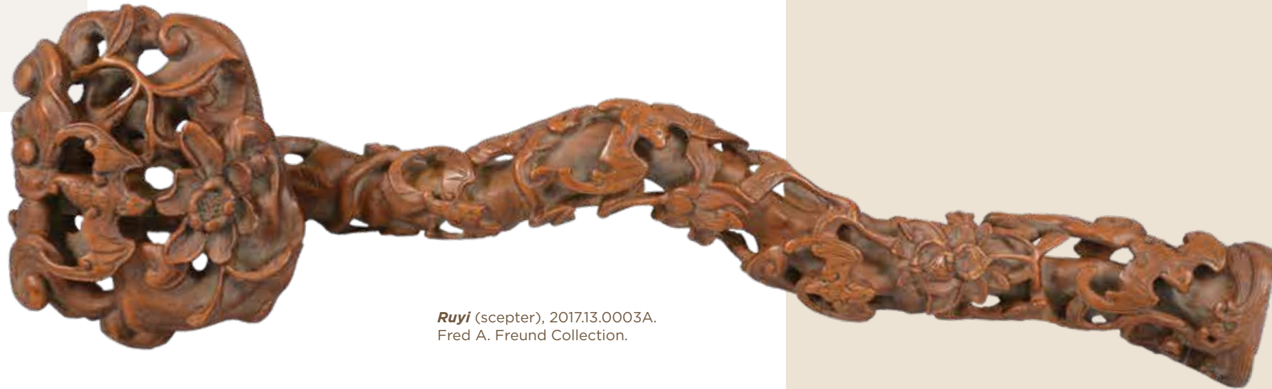
Ruyi (scepter), 2017.13.0003A. Fred A. Freund Collection.