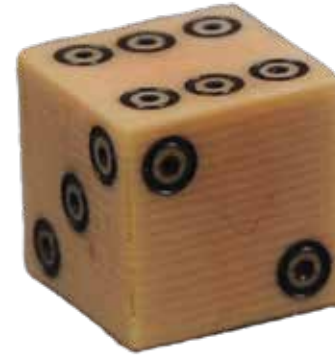
US die , 1977.01.0158J.

These game boards from our collection represent the intersection between art, craftsmanship, and gaming. The first is from the Democratic Republic of Congo and, on one end of the board, a detailed carving of a human head has been included. The next example is an awale game board from Côte d' Ivoire. Seeds are commonly used as game pieces and the goal of the game is to capture more seeds than your opponent. This object has been hand carved and coated with lacquer for durability and shine. The last example is a bao game board originating in Kenya. Bao is a mancala board game commonly played in East Africa. The complexity and elaborate strategy required to be proficient in the game has generated much scholarly interest in the fields of game theory and psychology. Typically either small stones, beans, or seeds function as game pieces and the game ends when a player either has no remaining pieces in a specific row or the player can no longer make a move.