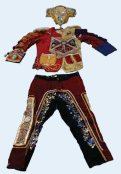
Festival costumes from Guatemala. 2017.12.0011.

These costumes are used at various annual festivals held in many towns across Sacatepequez Department, Guatemala. The pieces are new additions to the expansive Kieffer-Lopez Collection of Ethnographic Textiles and Artifacts.