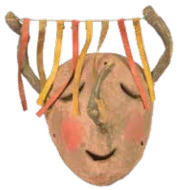
Mask, Mexico. 2017.14.0015.