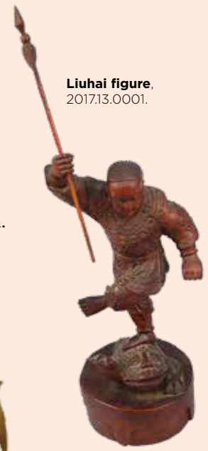
Liuhai figure. 2017.13.0001.