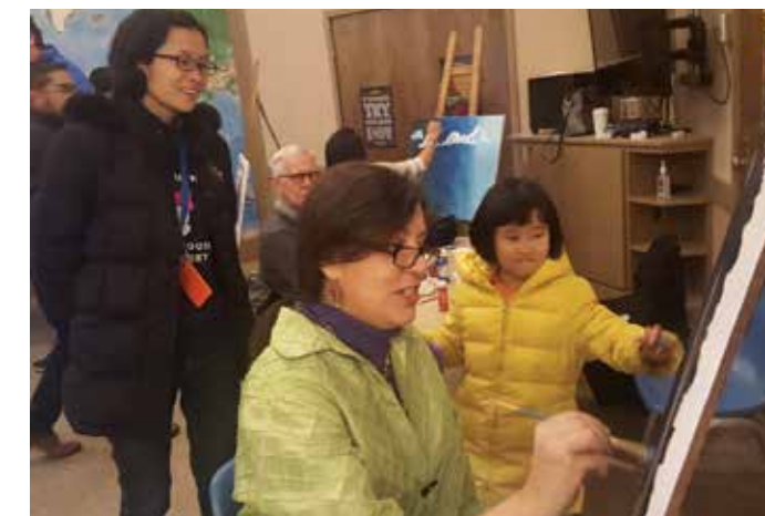
Native Pop artists at Orchard Downs.

for the Performing Arts, Krannert Art Museum, University Library, Natural History Survey, Illinois State Archaeological Survey, and Illinois Heritage Association.