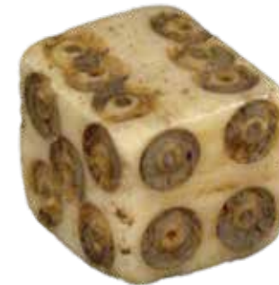
Egyptian die , 1914.05.0162.