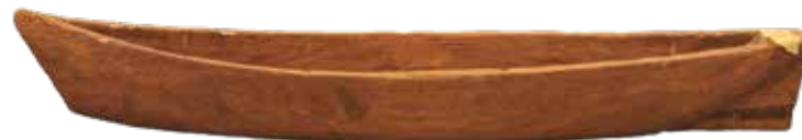
Toy canoe, Colombia and Ecuador. 2015.08.0068.