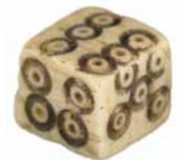
Egyptian die , 1914.05.0164.