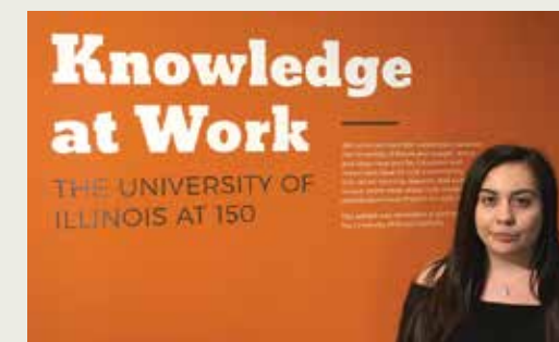
Exhibit graphics designed by students.