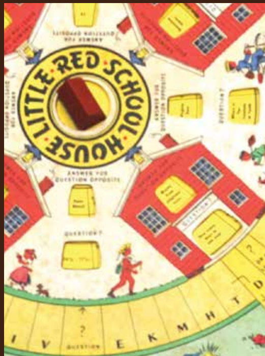
Little Red School House game.

The 2017–18 academic year has seen an important expansion in the number of collaborative exhibits at the Spurlock Museum. Rethinking the size, duration, and scope of temporary exhibits has enabled more opportunities to say "Yes!" when asked if we can create displays with other campus units and community groups. On the following pages, read about three projects that brought the Museum together with colleagues from three different areas of study and research on campus.