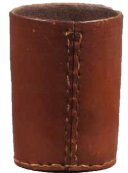
US dice shaker cup , 1977.01.0158A.

Dice are relatively ubiquitous worldwide, and ancient examples have been found in Iran dating to around 2500 BCE and in Egypt dating to around 3000 BCE. The Spurlock Museum houses dice from Egypt that date from between the 2 nd and 7 th centuries CE, Japan from the 19 th to mid-20 th centuries, and the United States from the mid-20 th century. Note the imperfections on several of our dice. Whether intentional or not, these flaws would affect the outcome of the roll. The owner of the dice would undoubtedly be aware of the quirks of each and plan their game accordingly.