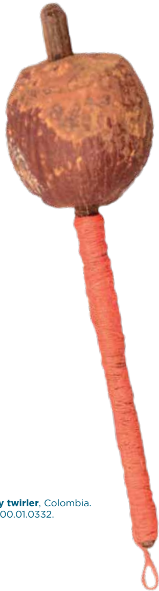
Toy twirler, Colombia. 2000.01.0332.