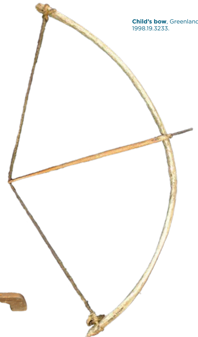
Child's bow, Greenland, 1998.19.3233.

This brief review of toys and game objects in the Spurlock Museum's collections serves to remind us that these types of artifacts have important cultural significance. All of us have played games for education or for entertainment, and both children and adults find enjoyment in playing games. Will you be traveling out of the country soon? Learn to play a game that is popular at your destination and it could be a great way to meet the locals. Staying home this summer? It's the perfect time to learn a new game, so get out there and get playing!