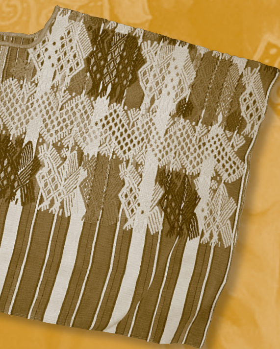
Left: Woman's Blouse (2004.15.0008)