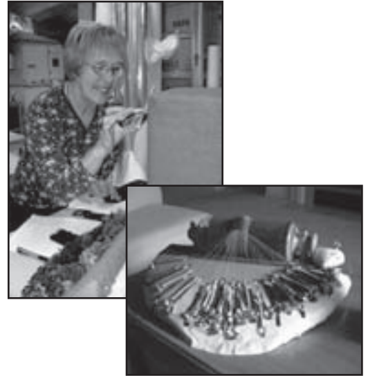
Above: Traditional style Danish bobbin lace pillow handmade in Denmark in the 1970s. The 44 bobbins required for this 3/4-inch wide lace are English Midlands style with spangles (ring of beads). Wood and bone bobbins are embellished with metal wire, paint, inlaid wood, carved rings, mother-and-babes inserts, among others. Most are hand-turned and carved in the late 20th century.