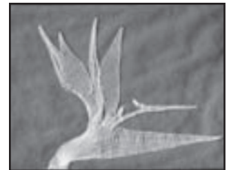
Below: Bird-of-Paradise flower designed and made by Karen in the bobbin lace technique using silk thread.